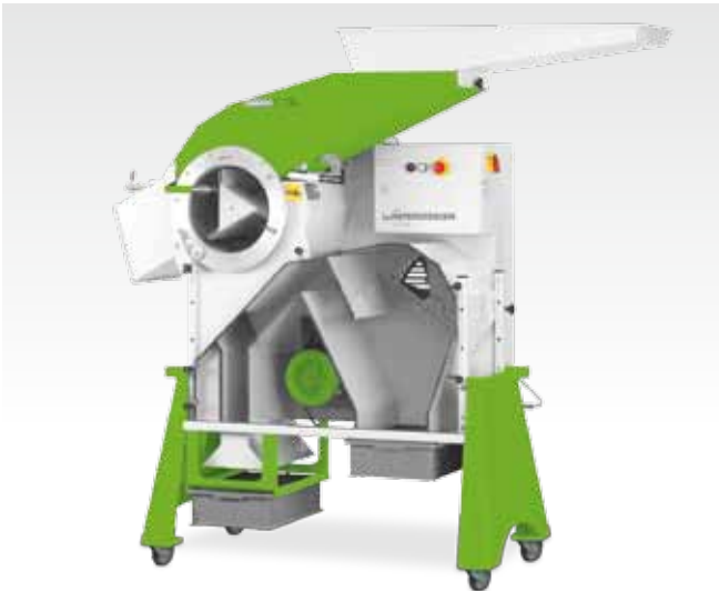
Chassis with 4 wheels