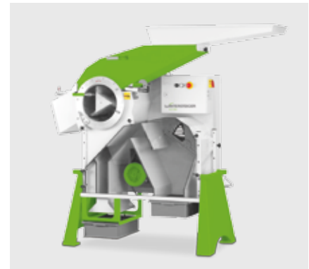
Laboratory thresher LD 350

As complete provider in agricultural testing, WINTERSTEIGER proves itself as strong partner for customers in various fields: