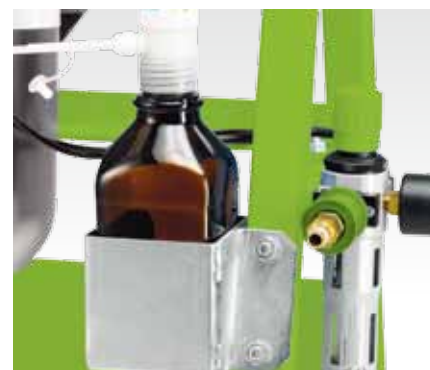
Dispensette with brown glass bottle