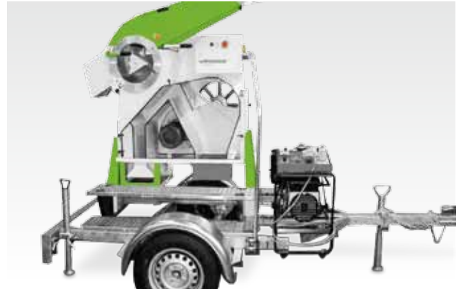
Single axle trailer with light