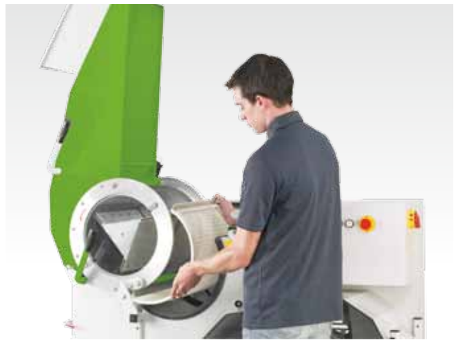
Changing the threshing basket