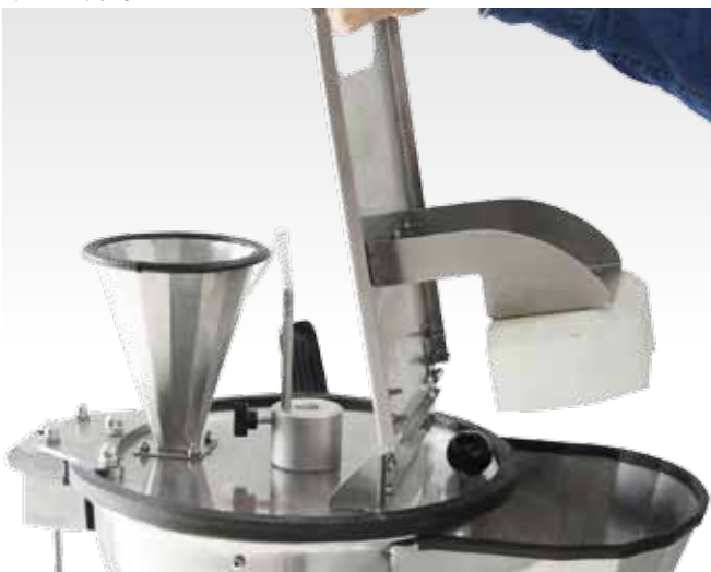
Option: Emptying device