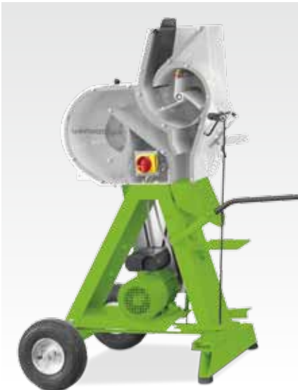
Option: LD 180 with chassis