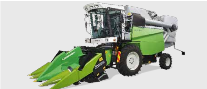
Plot combine Split

Laboratory thresher, laboratory corn sheller, seed dresser, sample chopper and sample divider