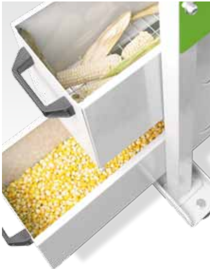
Collection container and kernel drawer