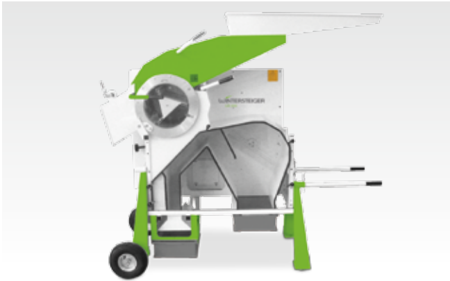
Chassis with 2 wheels

The following mobile versions of the WINTERSTEIGER LD 350 are available: