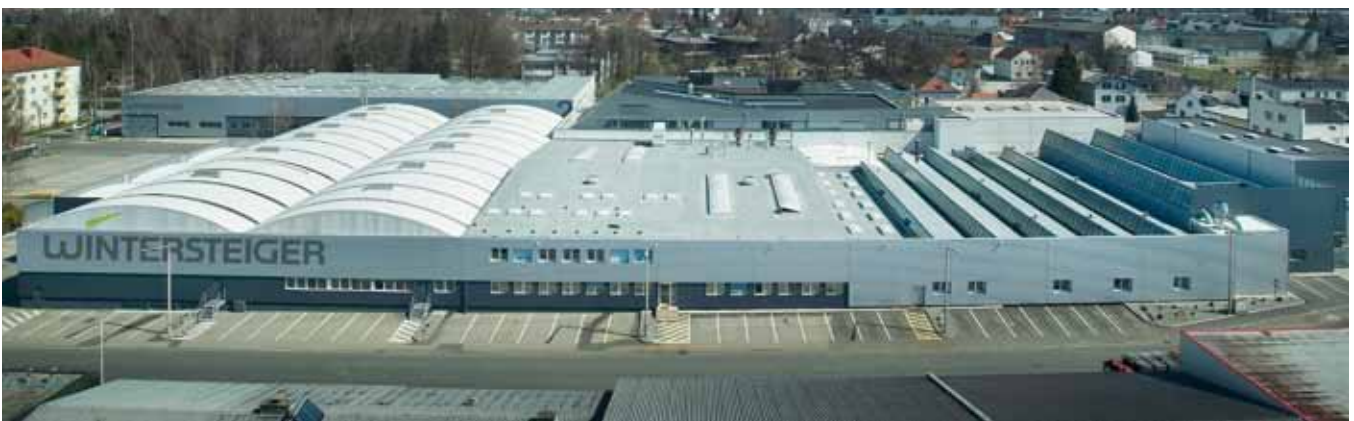
Headquarters located in Ried im Innkreis, Upper Austria