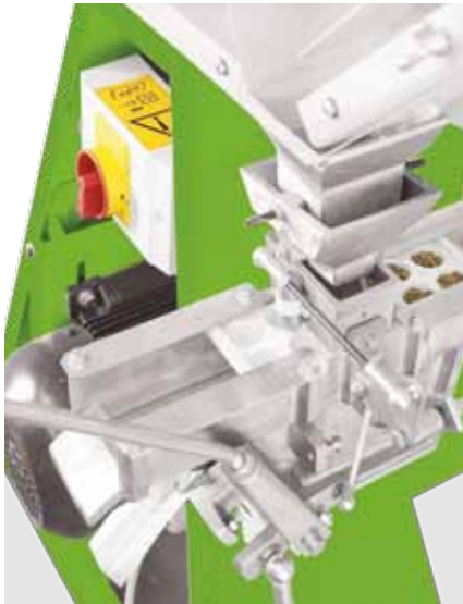
Option: Magazine hopper