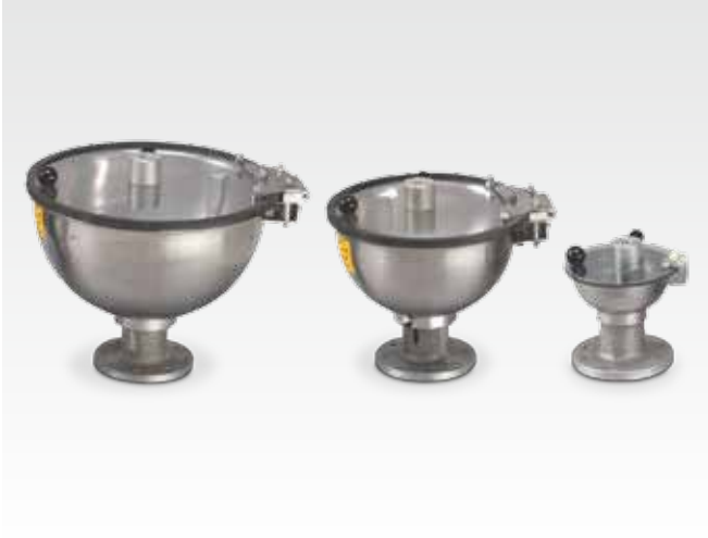
Seed bowl small - medium - large