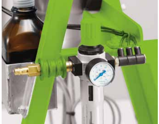
Option: Air-operated unit