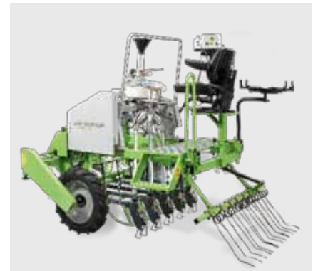
Plot drill Plotseed S