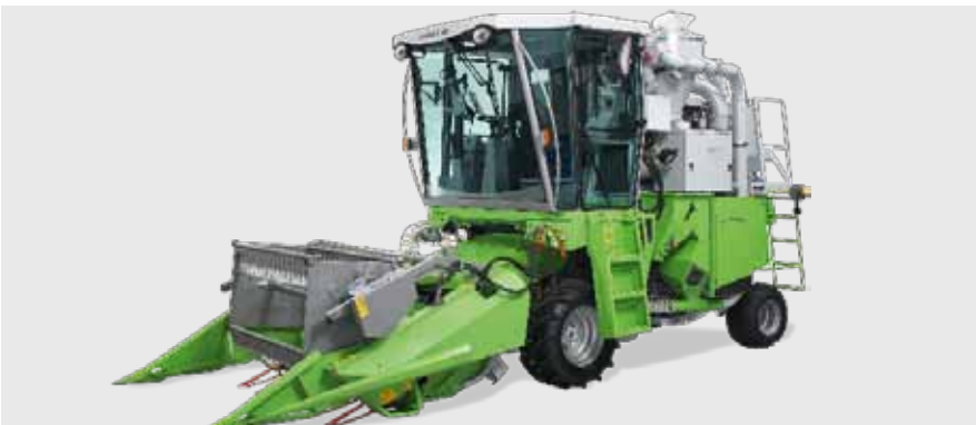
Plot combine Delta