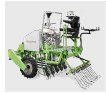
Plot drill Plotseed S