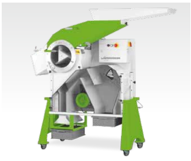
Chassis with 4 wheels