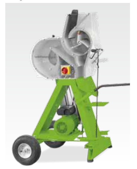
Option: LD 180 with chassis