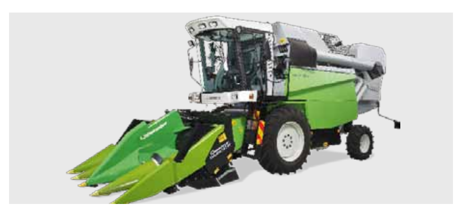
Plot combine Split

Laboratory thresher, laboratory corn sheller, seed dresser, sample chopper and sample divider