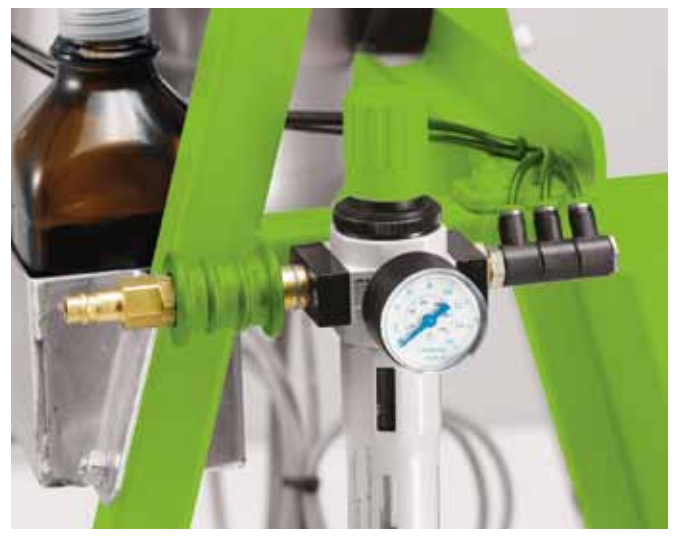
Option: Air-operated unit