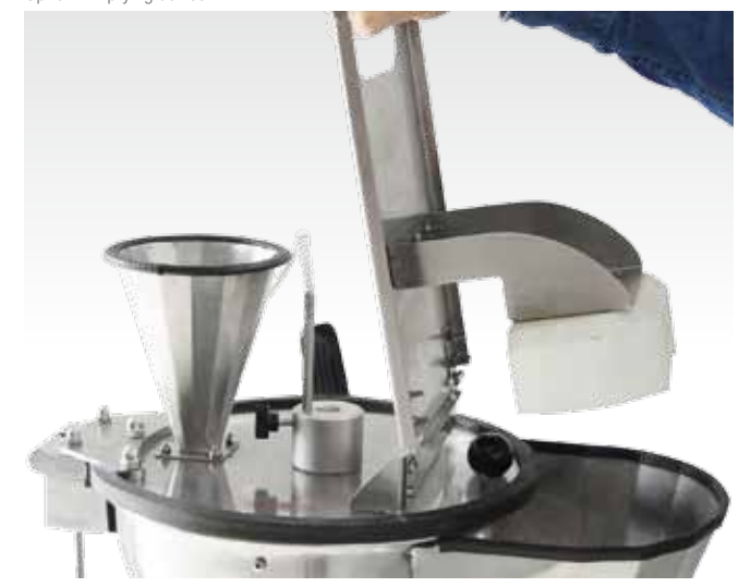
Option: Emptying device