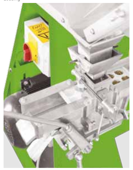
Option: Magazine hopper