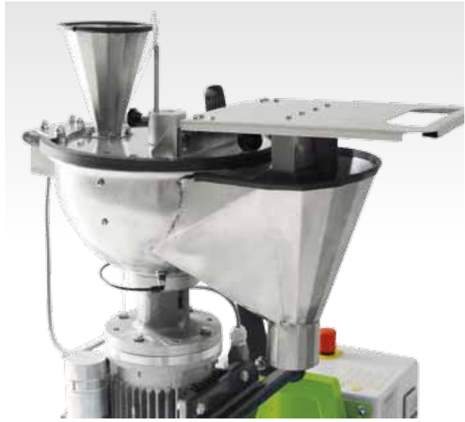
Option: Emptying device