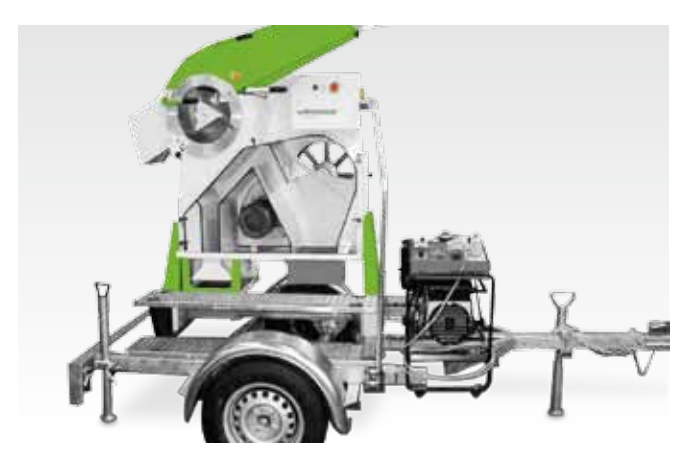
Single axle trailer with light