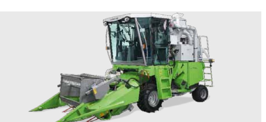
Plot combine Delta

As complete provider in agricultural testing, WINTERSTEIGER proves itself as strong partner for customers in various fields: