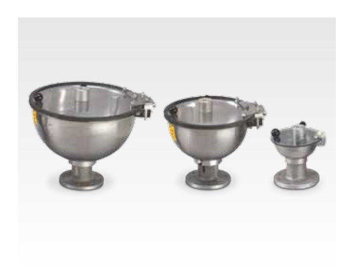
Seed bowl small - medium - large