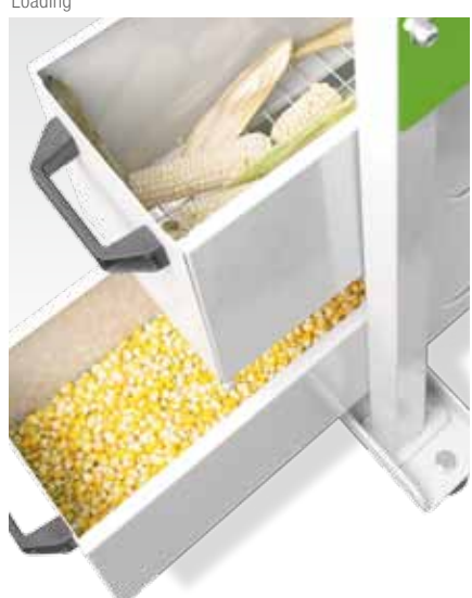
Collection container and kernel drawer