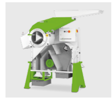
Laboratory thresher LD 350