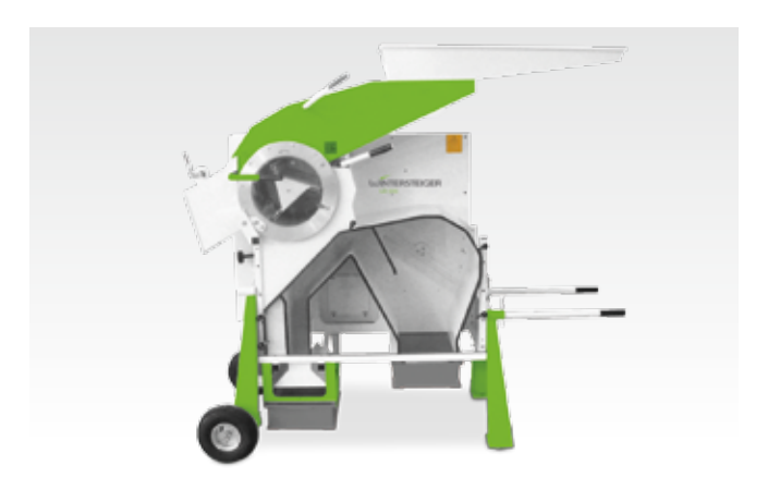
Chassis with 2 wheels

The following mobile versions of the WINTERSTEIGER LD 350 are available: